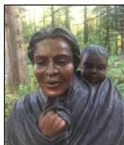
Sacajawea Statue (Location G)

Note: The map locations mentioned above, are shown on the back of this card and on page 58 of the “Lost Pass 1805” book, by Ted S. Hall.