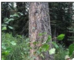
Witness Tree (Location F)